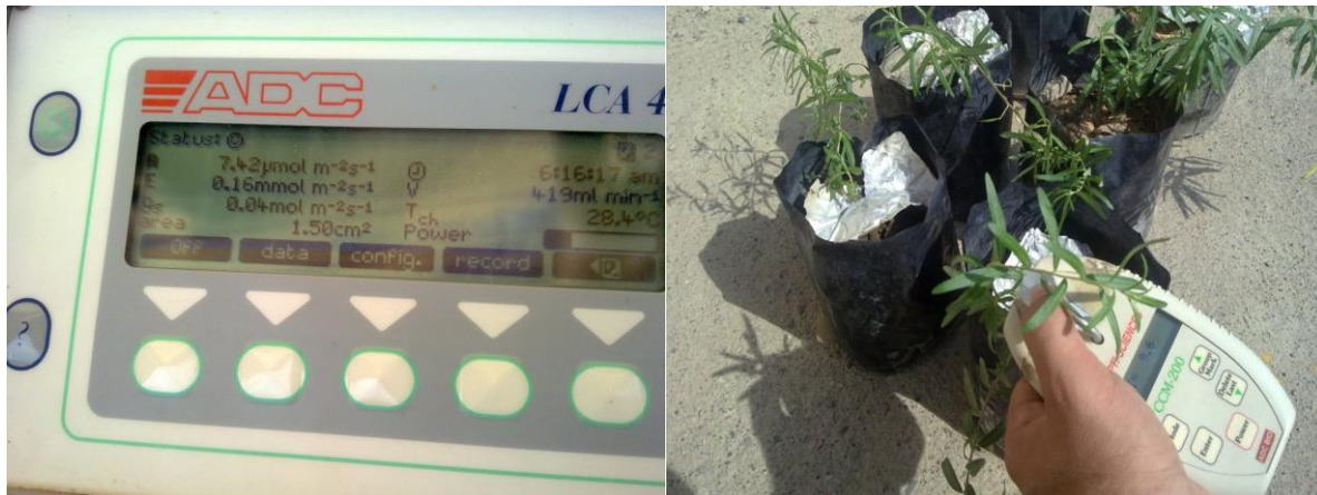
Fig. 1. Measurement of seedlings traits subjected to different devices.