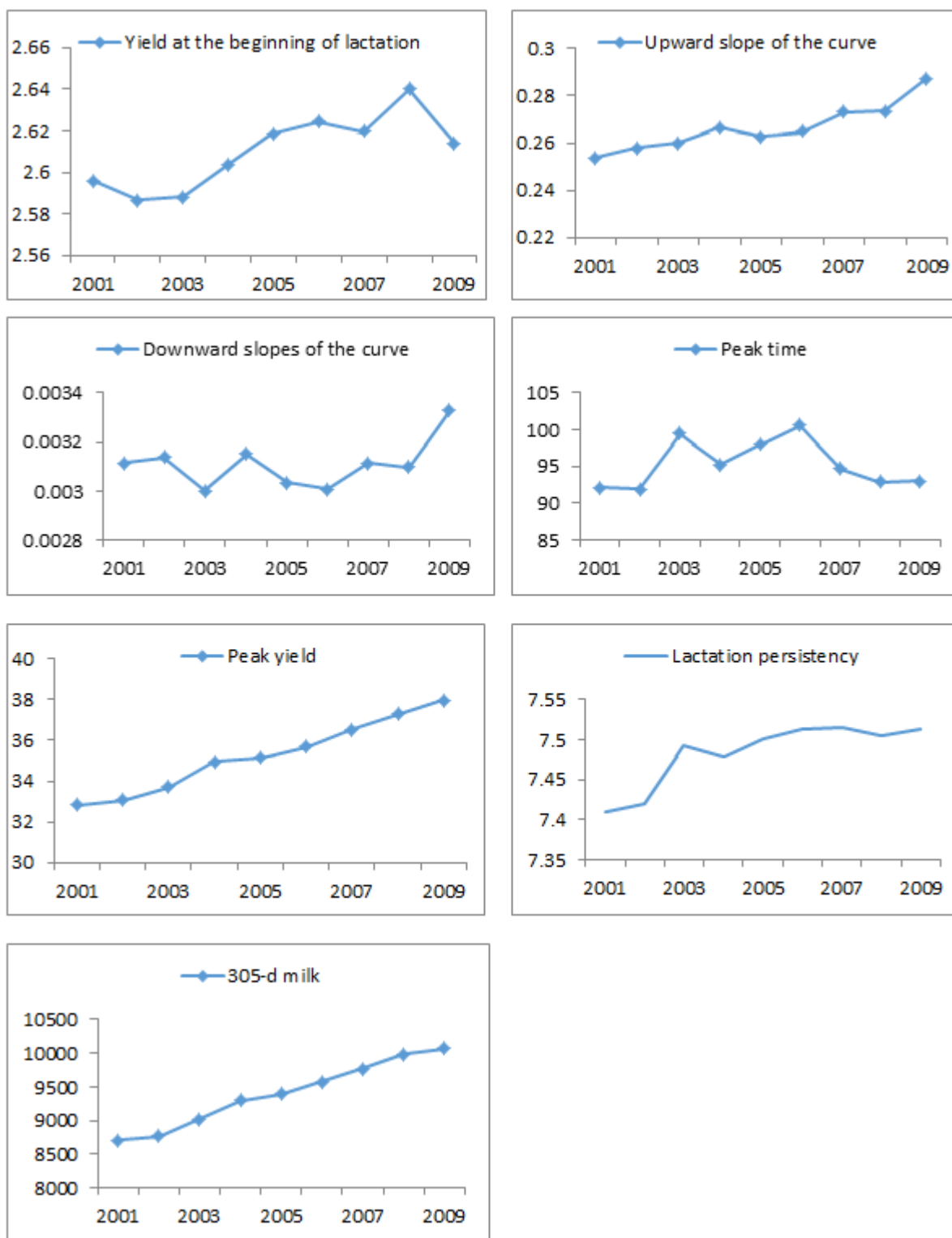
Figure 2 Phenotypic trends for lactation curve traits (initial yield, upward and downward slopes of the curve, peak time, peak yield, lactation persistency, and 305-d milk) for first parity cows born from 2001 to 2009

In the period from 2001 to 2009, initial yield, upward slope of the curve, lactation persistency, peak yield and 305-d milk yield significantly increased ( P < 0.05 ), but downward slope of the curve and peak time did not significantly changed ( P \geq 0.05 ). Phenotypic trends for 305-d milk