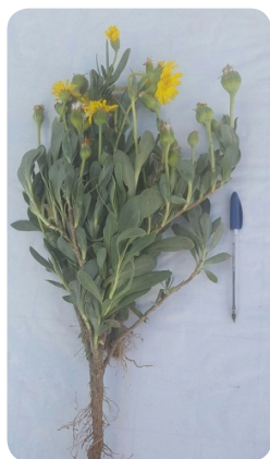
Fig. 1. Representation of the plant sample ( Hertia cheirifolia L.).

The plant sample ( H. cheirifolia ) was collected at the flowering stage (Fig. 1) in February 2012 from the area of Thala, Tunisia (Fig. 2). This region is characterized by calcareous brown soils and a variable continental climate with low temperatures in winter (5 °C) and high temperatures in summer (42 °C). The altitude varies from 750 m to 1200 m and the mean rainfall is about 322 mm/year. A voucher specimen ( H. cheirifolia ) (Hc 112) was deposited in the Laboratory of Medicinal Chemistry and Natural Products at the Faculty of Science of Monastir, Tunisia.